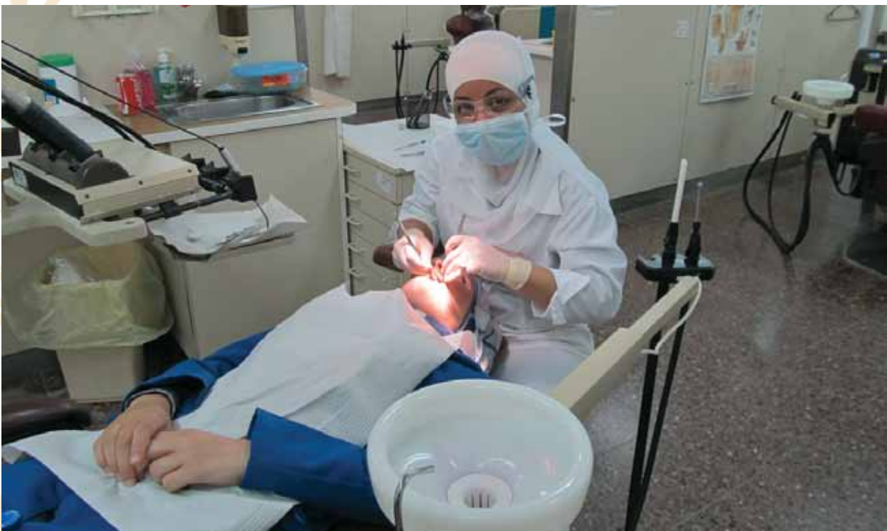
A future Dental Hygienist at work