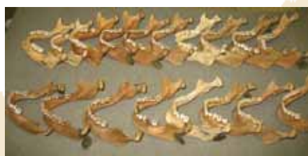
Osteologic material used in the research