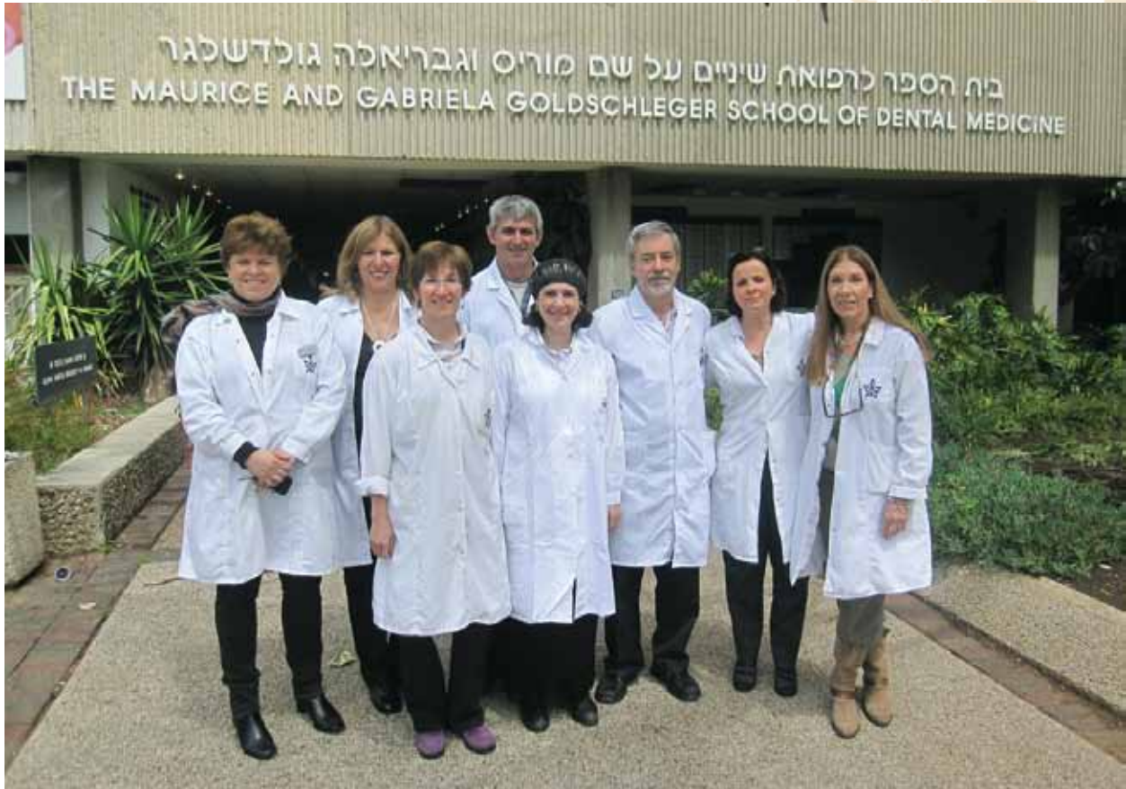
Pain clinic staff