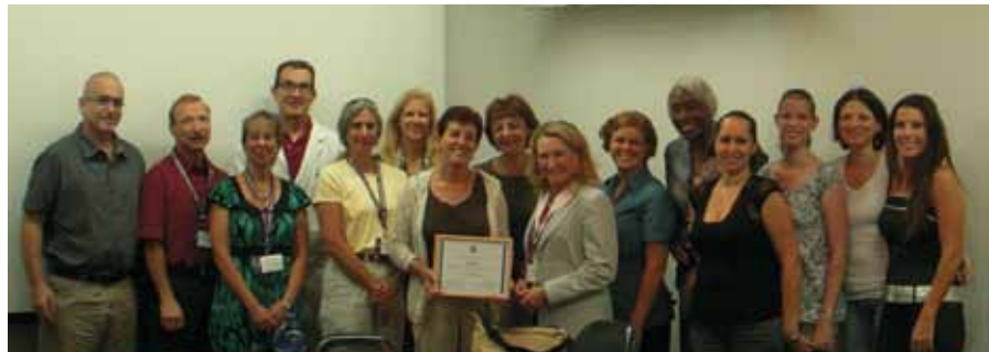
Dental Hygiene delegation in Israel