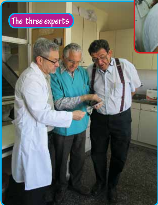
The three experts