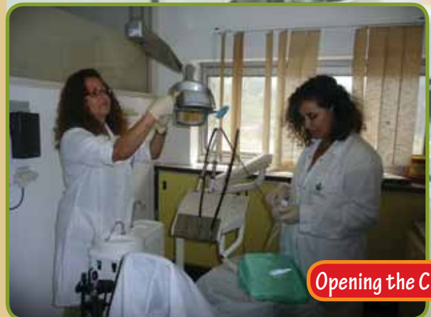
Opening the Clinics