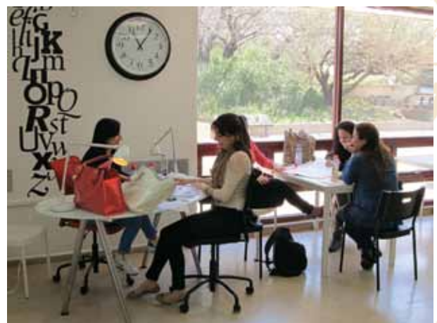
Students enjoying the new facility