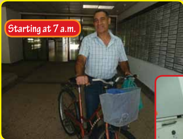
Starting at 7 a.m.