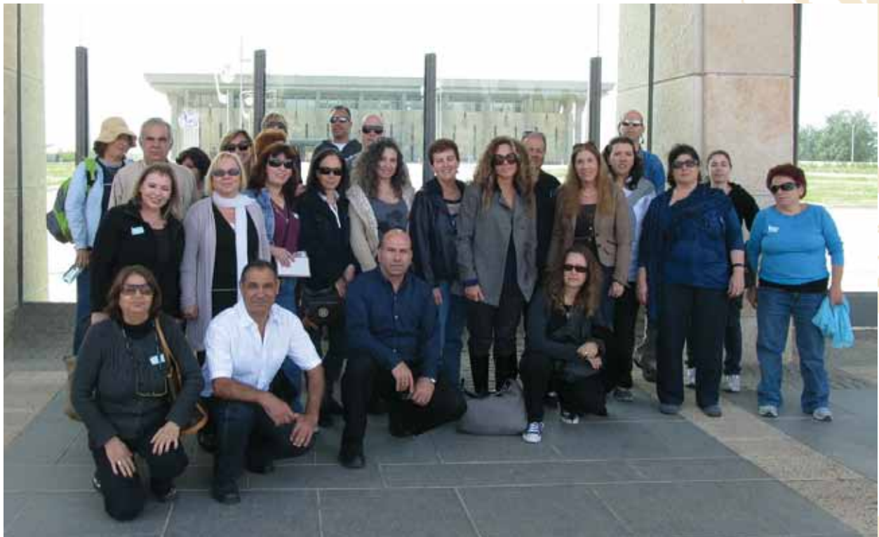
The administrative staff in front of the Parliament (The Knesset).