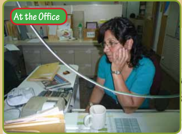
At the Office