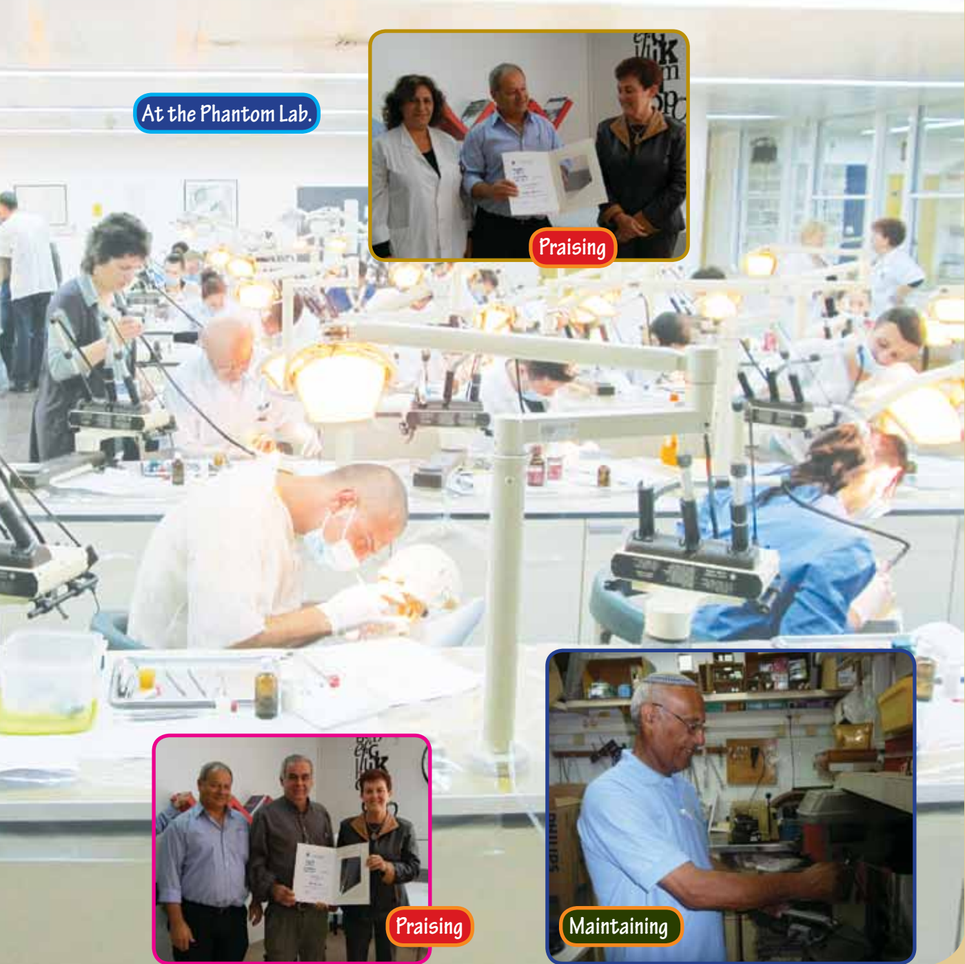
At the Phantom Lab.