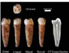
The Qesem lower left fourth premolar.