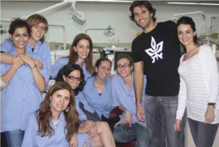
Post-graduate students in Orthodontics

The International Post-graduate Orthodontic program allows post graduate students to encounter the most advanced orthodontic treatment methods under the supervision of some of the leading orthodontists in Israel. Students from all over the world participate in this 3.5 year-long prestigious program, which allows them to become familiar with Israel and the Israeli culture.