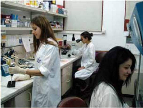
Graduate students experimenting oral mucosa derived stem cell biology at the Alpha Omega Research Laboratory at the Goldschlager School of Dental Medicine

group found that the Epidermal Growth Factor (EGF) receptor is involved in this action. This finding was puzzling enough since EGF (which would activate this receptor) was never found in EMD preparations. After many painstaking experiments an explanation was found: EMD causes the activation of enzymes of the MMP (matrix metalloproteinase) family on the cell surface, which cleave off the cell membrane a molecule that resembles EGF. Once cleaved, this molecule (HB-EGF) is capable of activating the EGF receptor.