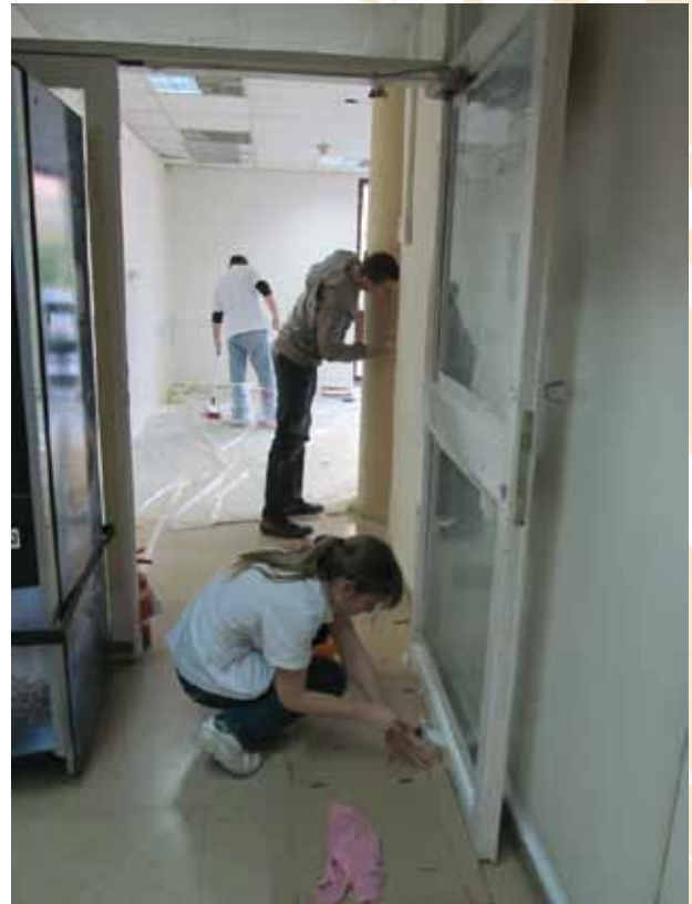
Students renovating the place

The lounge symbolizes the start of a new era and, as witnessed by the photographs, is enjoyed by everyone.