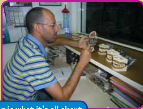
Occlusion is what it's all about