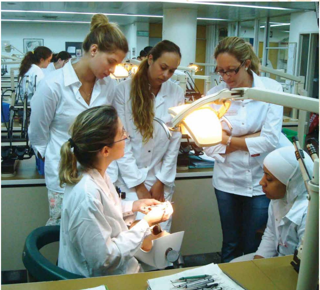
Dental Hygiene Students